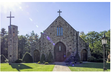
St. Severin, Drifting Mission Community