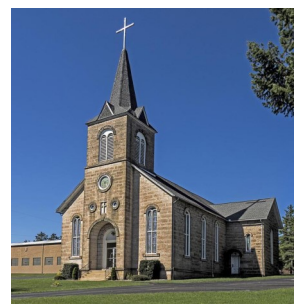
St. Mary, Frenchville Mission Community