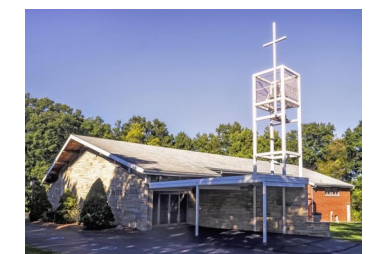
Ss. Peter and Paul Grassflat

St. Agnes Parish 22 Saint Agnes Drive Morrisdale, Pennsylvania 16858 814-342-2583