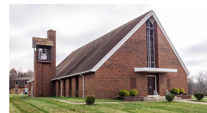
Ss. Peter and Paul Hawk Run