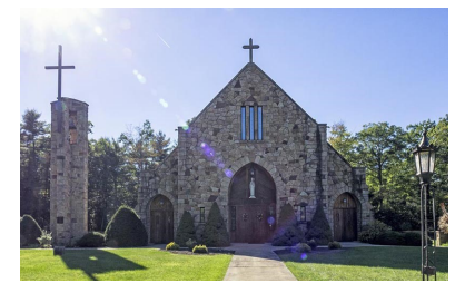
St. Severin, Drifting Mission Community