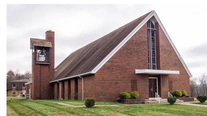
Ss. Peter and Paul Hawk Run