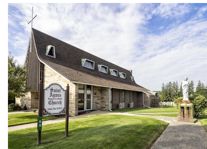
St. Agnes Parish, Morrisdale