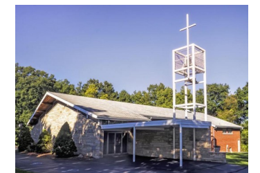
Ss. Peter and Paul Grassflat

St. Agnes Parish 22 Saint Agnes Drive Morrisdale, Pennsylvania 16858 814-342-2583