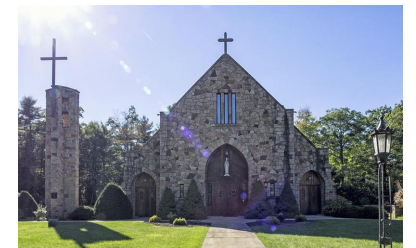
St. Severin, Drifting Mission Community