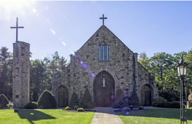
St. Severin, Drifting Mission Community