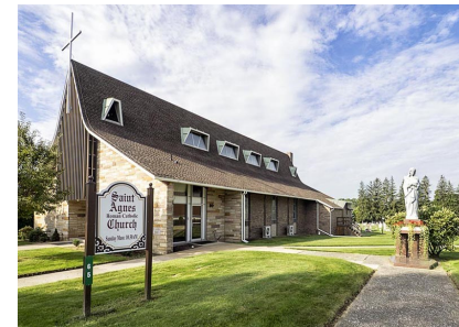
St. Agnes Parish, Morrisdale