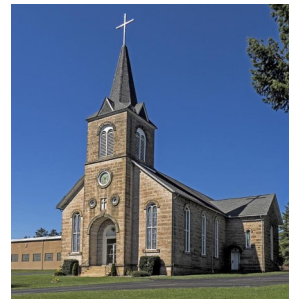
St. Mary, Frenchville Mission Community

November 10th, 2024 - 32nd Sunday in Ordinary Time