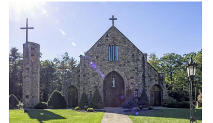
St. Severin, Drifting Mission Community