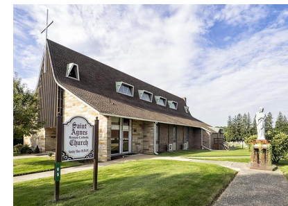
St. Agnes Parish, Morrisdale