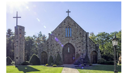
St. Severin, Drifting Mission Community