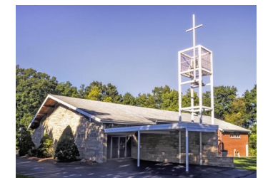
Ss. Peter and Paul Grassflat

St. Agnes Parish 22 Saint Agnes Drive Morrisdale, Pennsylvania 16858 814-342-2583