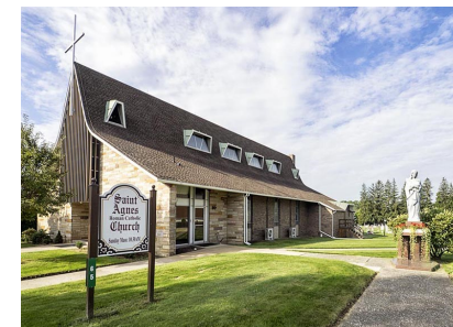
St. Agnes Parish, Morrisdale