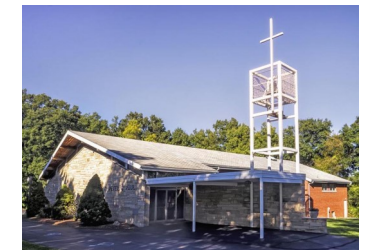
Ss. Peter and Paul Grassflat

St. Agnes Parish 22 Saint Agnes Drive Morrisdale, Pennsylvania 16858 814-342-2583