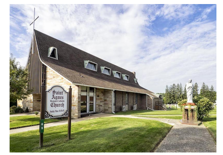
St. Agnes Parish, Morrisdale