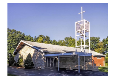
Ss. Peter and Paul Grassflat

St. Agnes Parish 22 Saint Agnes Drive Morrisdale, Pennsylvania 16858 814-342-2583