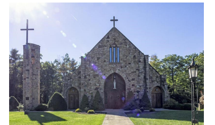
St. Severin, Drifting Mission Community