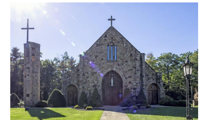
St. Severin, Drifting Mission Community