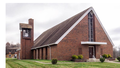
Ss. Peter and Paul Hawk Run