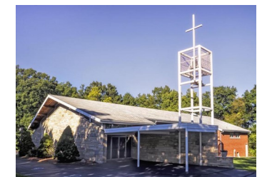
Ss. Peter and Paul Grassflat

St. Agnes Parish 22 Saint Agnes Drive Morrisdale, Pennsylvania 16858 814-342-2583