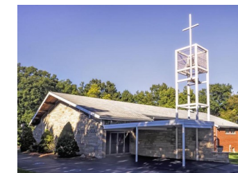
Ss. Peter and Paul Mission, Grassflat

St. Agnes Parish 22 Saint Agnes Drive Morrisdale, Pennsylvania 16858 814-342-2583