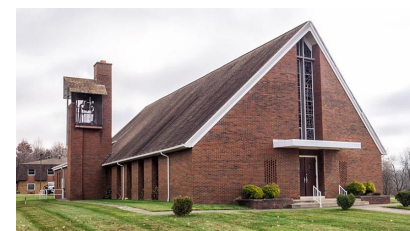
Ss. Peter and Paul Mission, Hawk Run