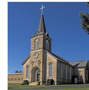
St. Mary Parish, Frenchville