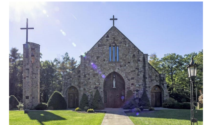
St. Severin, Drifting Mission Community