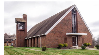
Ss. Peter and Paul Hawk Run