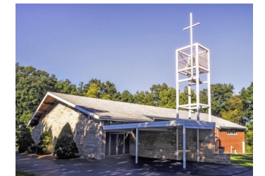
Ss. Peter and Paul Grassflat

St. Agnes Parish 22 Saint Agnes Drive Morrisdale, Pennsylvania 16858 814-342-2583