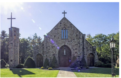
St. Severin, Drifting Mission Community