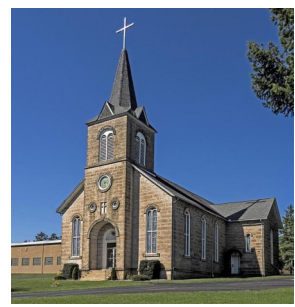
St. Mary, Frenchville Mission Community