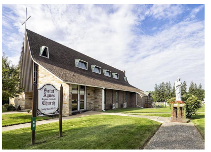
St. Agnes Parish, Morrisdale