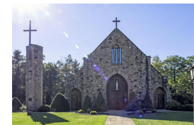
St. Severin, Drifting Mission Community