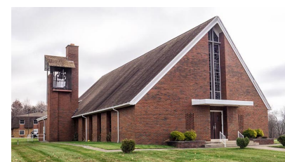
Ss. Peter and Paul Hawk Run