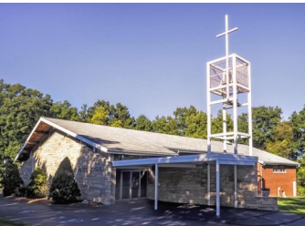
Ss. Peter and Paul Grassflat

St. Agnes Parish 22 Saint Agnes Drive Morrisdale, Pennsylvania 16858 814-342-2583