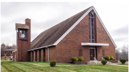
Ss. Peter and Paul Hawk Run