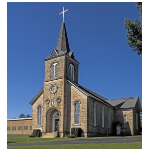
St. Mary, Frenchville Mission Community

June 23, 2024 - 12th Sunday in Ordinary Time