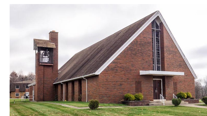
Ss. Peter and Paul Hawk Run