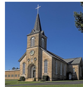
St. Mary, Frenchville Mission Community