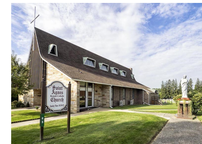
St. Agnes Parish, Morrisdale