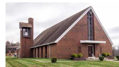
Ss. Peter and Paul Hawk Run