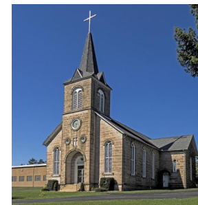
St. Mary, Frenchville Mission Community

June 2, 2024 - Most Holy Body & Blood of Christ (Corpus Christi)