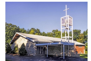
Ss. Peter and Paul Grassflat

St. Agnes Parish 22 Saint Agnes Drive Morrisdale, Pennsylvania 16858 814-342-2583