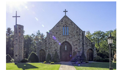
St. Severin, Drifting Mission Community