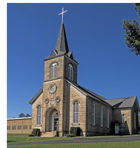
St. Mary, Frenchville Mission Community

August 4, 2024 - 18th Sunday in Ordinary Time