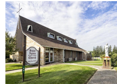
St. Agnes Parish, Morrisdale