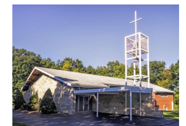
Ss. Peter and Paul Grassflat

St. Agnes Parish 22 Saint Agnes Drive Morrisdale, Pennsylvania 16858 814-342-2583