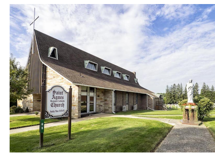
St. Agnes Parish, Morrisdale