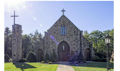
St. Severin, Drifting Mission Community