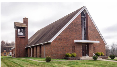
Ss. Peter and Paul Hawk Run