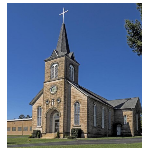
St. Mary, Frenchville Mission Community

June 9, 2024 - 10th Sunday in Ordinary Time