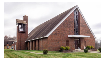
Ss. Peter and Paul Hawk Run