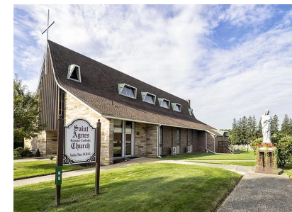
St. Agnes Parish, Morrisdale