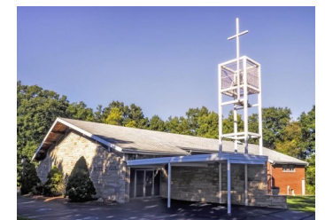
Ss. Peter and Paul Grassflat

St. Agnes Parish 22 Saint Agnes Drive Morrisdale, Pennsylvania 16858 814-342-2583