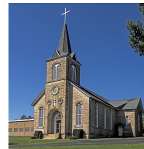
St. Mary, Frenchville Mission Community

April 20th, 2025 - 2nd Easter Sunday/Resurrection of the Lord