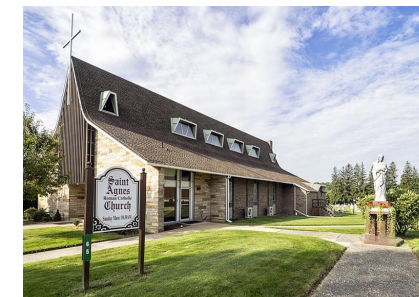
St. Agnes Parish, Morrisdale