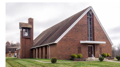
Ss. Peter and Paul Hawk Run