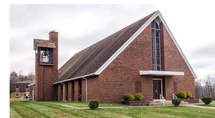
Ss. Peter and Paul Hawk Run