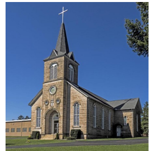
St. Mary, Frenchville Mission Community

July 14, 2024 - 15th Sunday in Ordinary Time