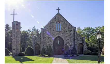
St. Severin, Drifting Mission Community