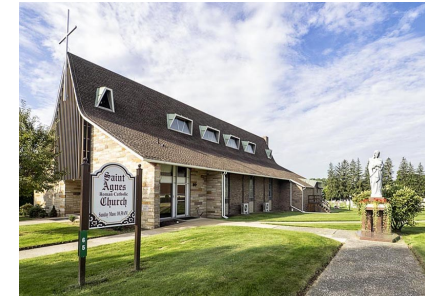
St. Agnes Parish, Morrisdale