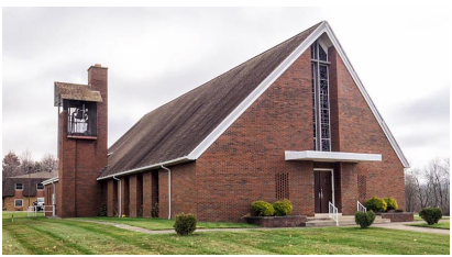
Ss. Peter and Paul Hawk Run