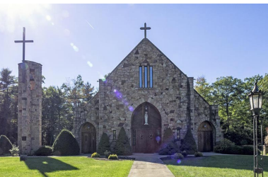
St. Severin, Drifting Mission Community