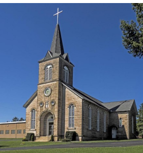
St. Mary, Frenchville Mission Community

February 1, 2026—Fourth Sunday in Ordinary Time