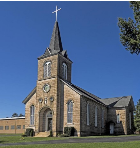
St. Mary, Frenchville Mission Community