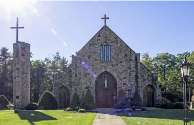
St. Severin, Drifting Mission Community