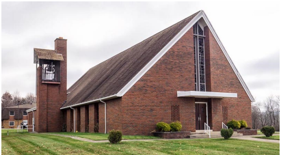
Ss. Peter and Paul Hawk Run