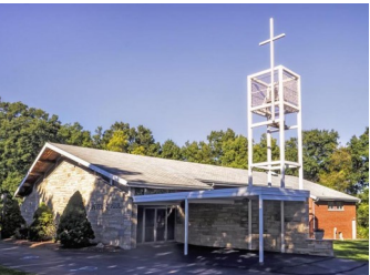
Ss. Peter and Paul Grassflat

St. Agnes Parish 22 Saint Agnes Drive Morrisdale, Pennsylvania 16858 814-342-2583