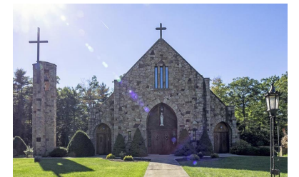
St. Severin, Drifting Mission Community