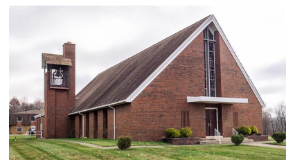
Ss. Peter and Paul Hawk Run