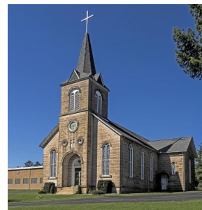
St. Mary, Frenchville Mission Community