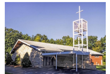
Ss. Peter and Paul Grassflat

St. Agnes Parish 22 Saint Agnes Drive Morrisdale, Pennsylvania 16858 814-342-2583