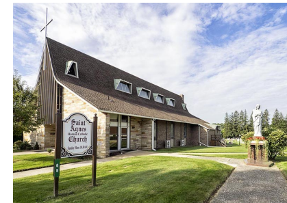
St. Agnes Parish, Morrisdale